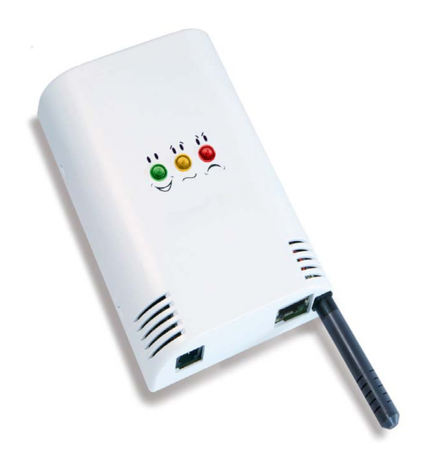
Fig. 1: AQ-CLIMATE CONTROL sensor system.

A two-beam infrared sensor (NDIR) is mounted on a sensor holder inside the plastic housing and above a diffusion opening to measure the carbon dioxide concentration. The sensors for the relative humidity (15 to 95 % RH) and temperature (0 to 50° C) are located in a sensing element made of PVC protruding from the bottom of the housing. The microprocessor for processing data, the digital outputs and an actuator (relay contact) are additionally integrated in the housing (see Fig. 1).